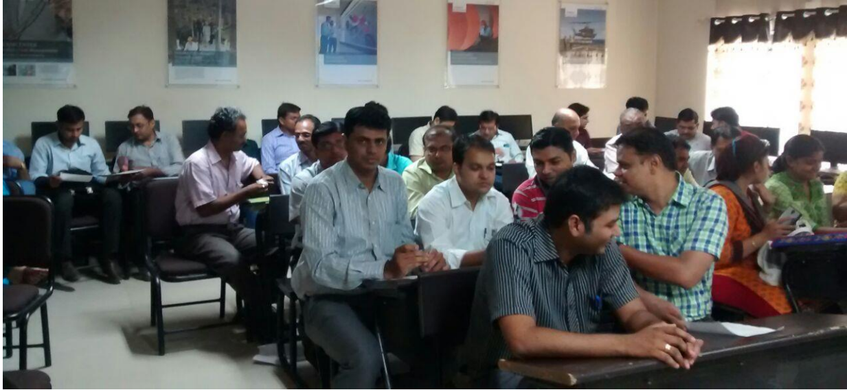
Theory Session during STTP