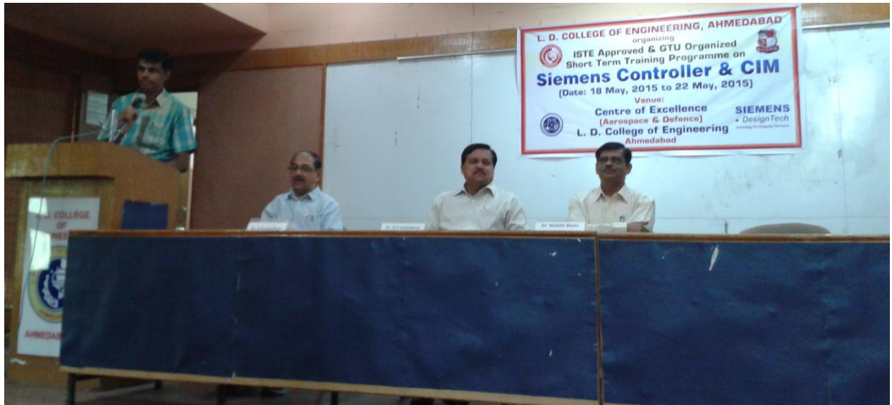
Inauguration of the STTP

On the last day the participants were awarded the certificates in the valedictory program.