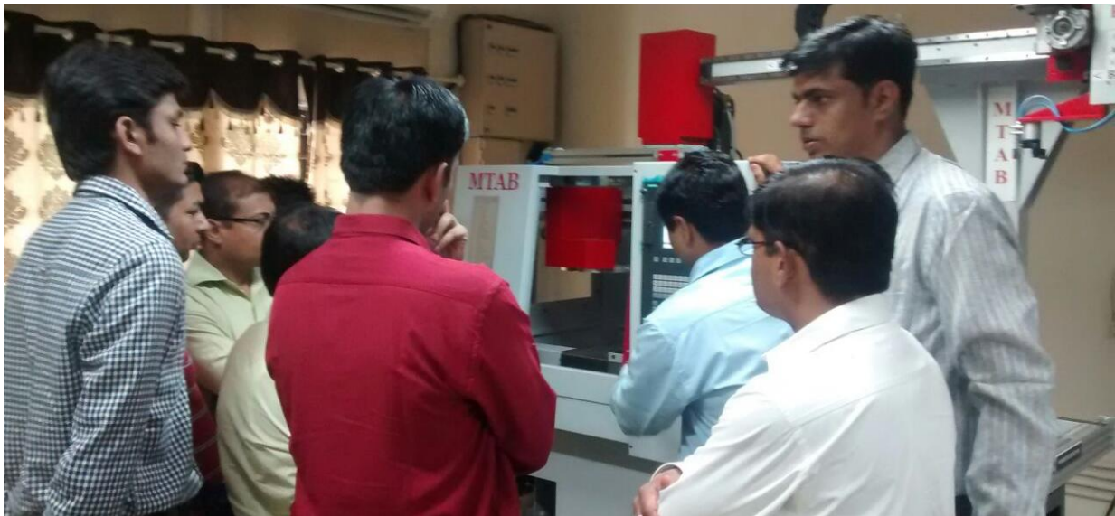
Practical Session during STTP