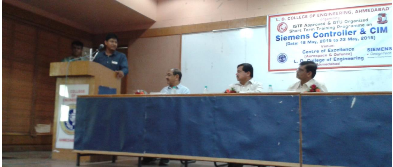
Participant feedback in the valedictory session